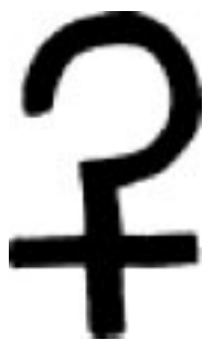
Astronomical symbol for Ceres, "sickle" variant

The color most often associated with twilight is purple, which is also very popular in the gay community. Purple or lavender is created by combining pink and blue, and serves as a fitting symbol for a group that neither follows traditional gender roles within society nor conforms to the expectations of suburban life. It also is expressive of the Twilight Guard's attempt to meld the values of both old guard and new guard leather. As in other leather organizations, the word Guard represents a traditional leather standard. However, it also targets a broader community than such terms as "MC," or motorcycle club, convey in the gay community.