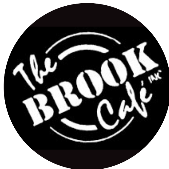
Logo from America's oldest gay bar, circa 1990