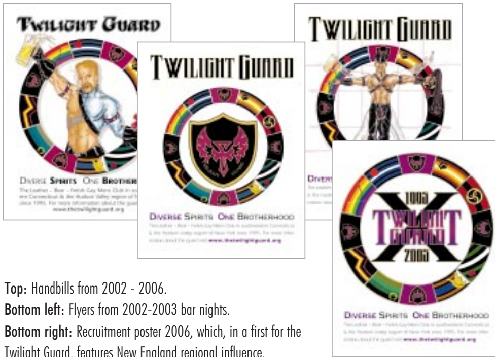
Top: Handbills from 2002 - 2006.