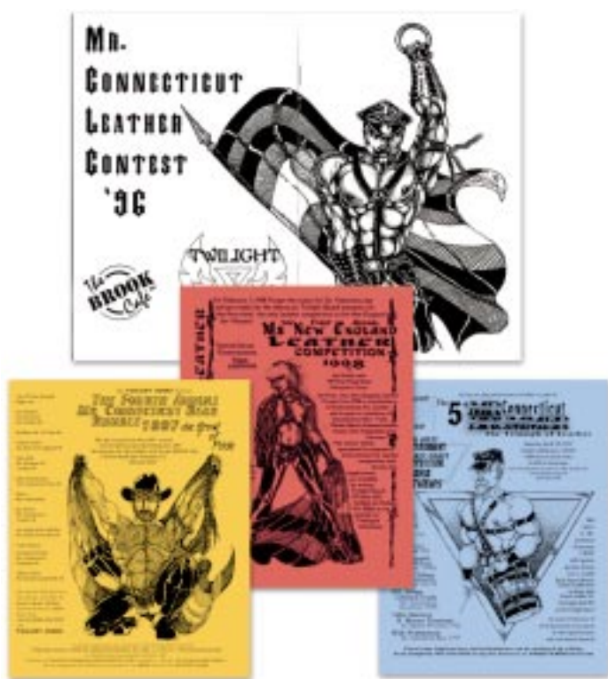
Program from the 1996 Mr. CT Leather contest, and flyers for Mr. CT Bear 1997, Ms. New England Leather 1998, and Mr. CT Drummer 1997 Contest.

Shortly thereafter, it became clear that our relationship with our sponsors was deteriorating. In retrospect, we now know that they were planning to re-establish themselves in Hartford and operate a drag club. Material support for the club's activities—in exchange for bringing business to the bar—dried up. In the end, the lack of even basic moral support from our sponsors negatively impacted some of our planned activities, making the club and its